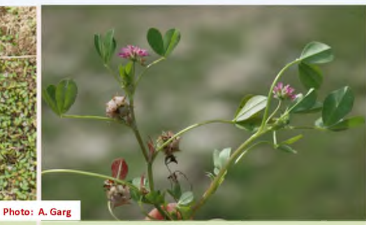
Trifolium tomentosum L. at Bhoj Ramsar site wetland, Madhya Pradesh

A total of 62 specimens were identified in connection with the project 'Identification of old unidentified specimens of BSA'.