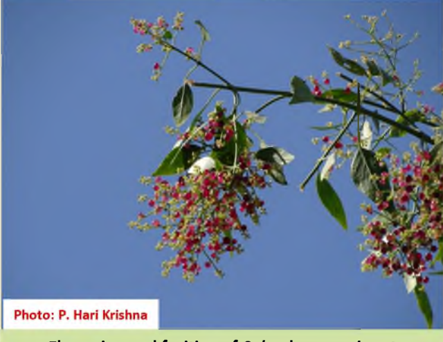
Flowering and fruiting of Salvadora persica at Botanical Garden, AZRC, BSI, Jodhpur