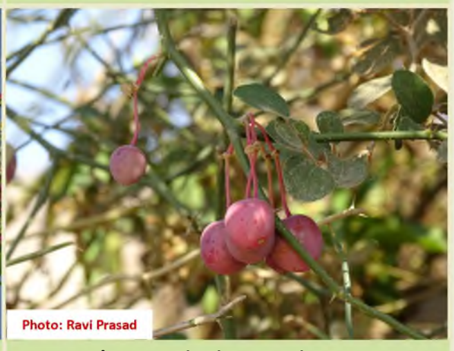
Fruiting of Capparis decidua at Sariska Tiger Reserve, Alwar district, Rajasthan