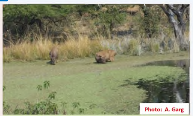
A view of Bhoj Ramsar site wetland - water surface covered with Azolla pinnata

Under the project 'Flora of Chhattisgarh' Vol.-II, Dr. A.K. Verma, Scientist 'B' updated nomenclature of 50